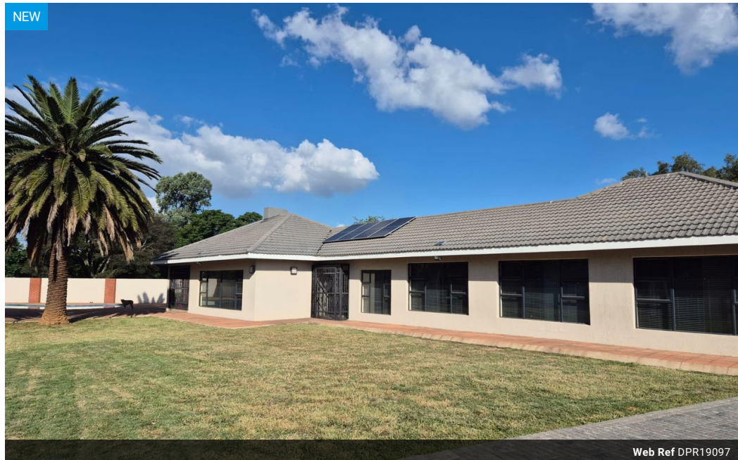
Web Ref DPR19097

Shop 2, The Palms Shopping Center, Louis Trichardt Blvd, Vanderbijlpark, 1911