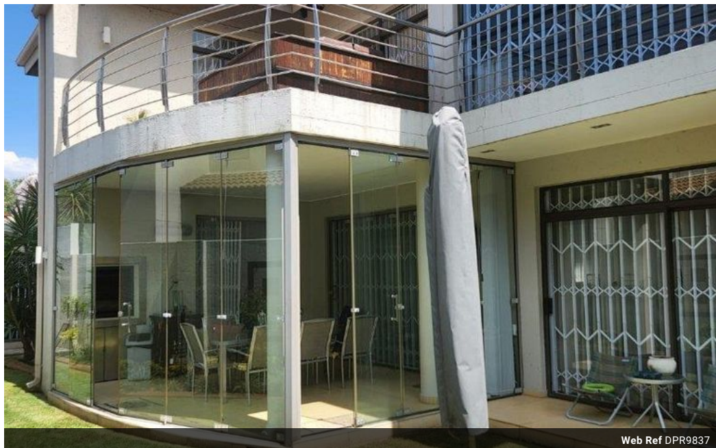
Web Ref DPR9837

Shop 2, The Palms Shopping Center, Louis Trichardt Blvd, Vanderbijlpark, 1911