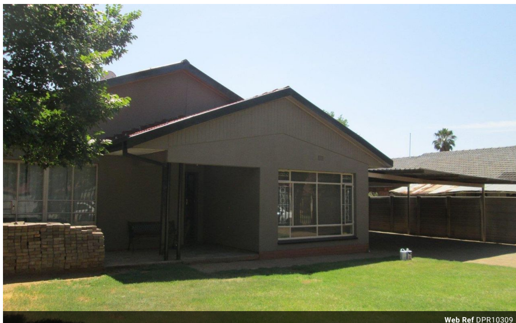
Web Ref DPR10309

18 Klipriver Drive Three Rivers Vereeniging