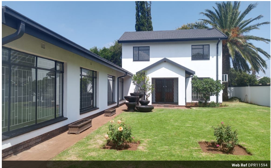
Web Ref DPR11594

18 Klipriver Drive Three Rivers Vereeniging