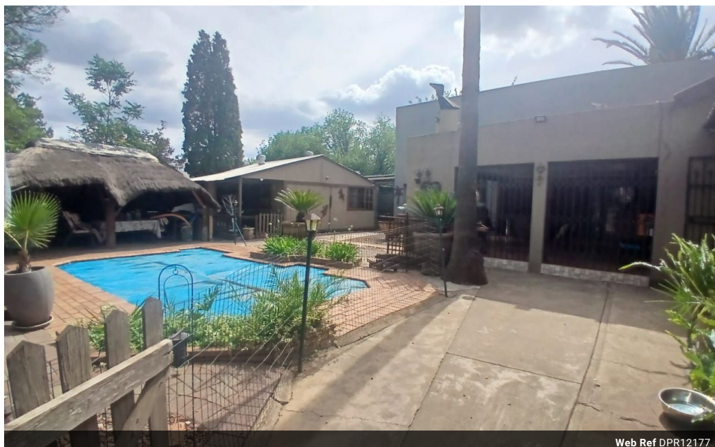
Web Ref DPR12177

18 Klipriver Drive Three Rivers Vereeniging