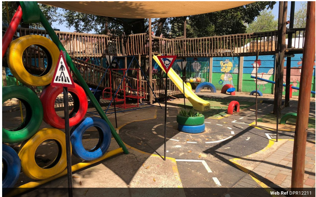
Web Ref DPR12211

18 Klipriver Drive Three Rivers Vereeniging