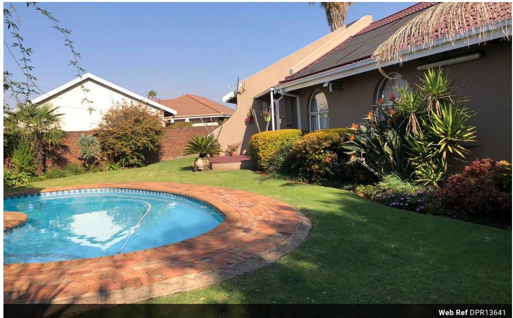
Web Ref DPR13641

18 Klipriver Drive Three Rivers Vereeniging