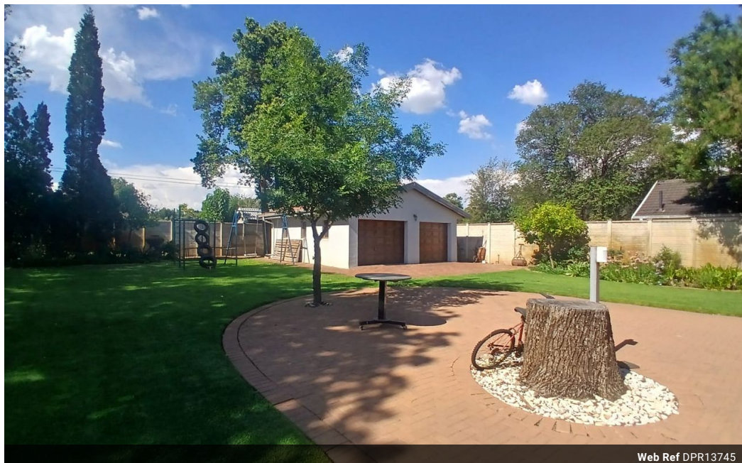
Web Ref DPR13745

18 Klipriver Drive Three Rivers Vereeniging