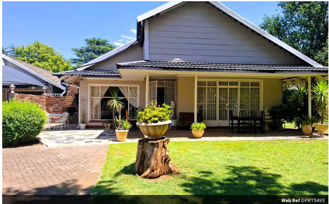
Web Ref DPR15495

18 Klipriver Drive Three Rivers Vereeniging