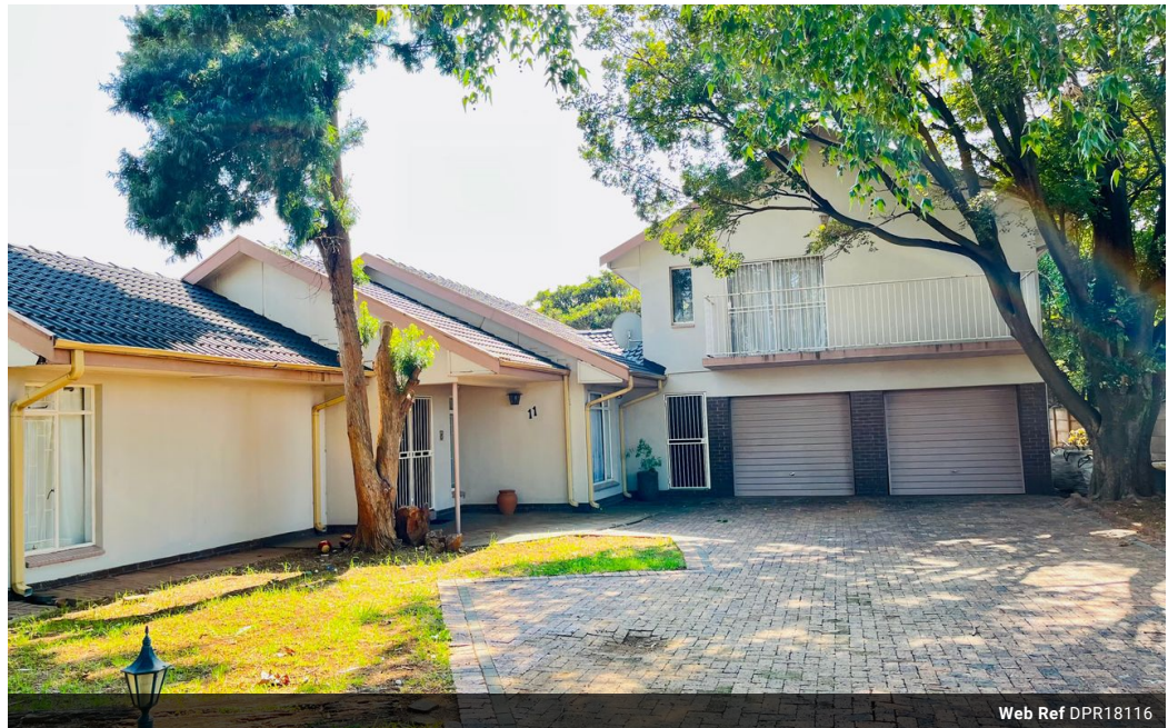
Web Ref DPR18116

18 Klipriver Drive Three Rivers Vereeniging