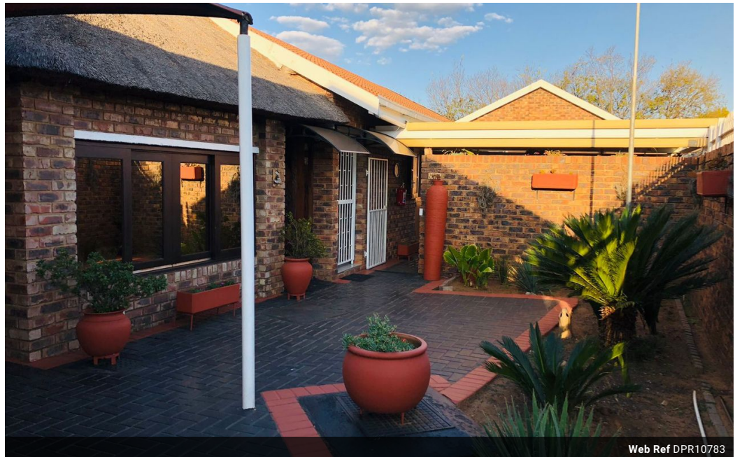
Web Ref DPR10783

18 Klipriver Drive Three Rivers Vereeniging