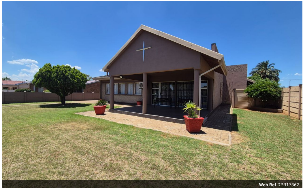
Web Ref DPR17362

18 Klipriver Drive Three Rivers Vereeniging