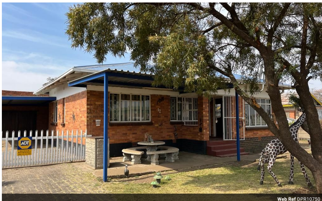
Web Ref DPR10750

18 Klipriver Drive Three Rivers Vereeniging