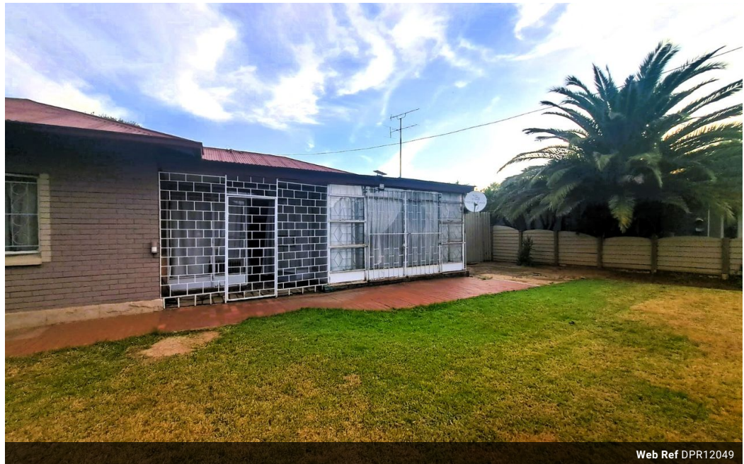
Web Ref DPR12049

18 Klipriver Drive Three Rivers Vereeniging