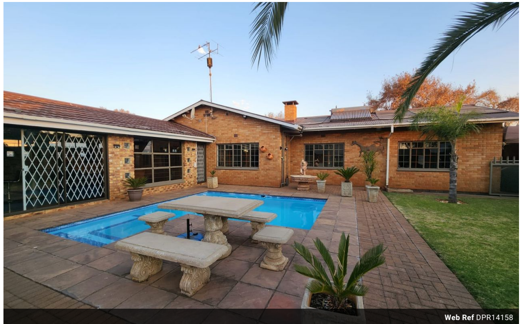
Web Ref DPR14158

18 Klipriver Drive Three Rivers Vereeniging