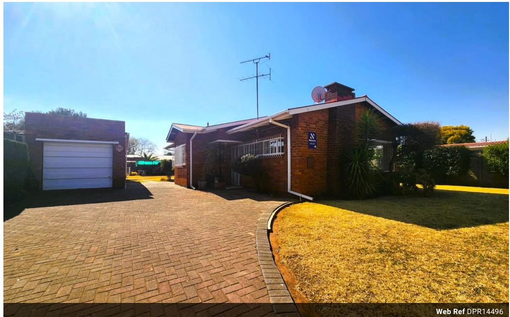
Web Ref DPR14496

18 Klipriver Drive Three Rivers Vereeniging