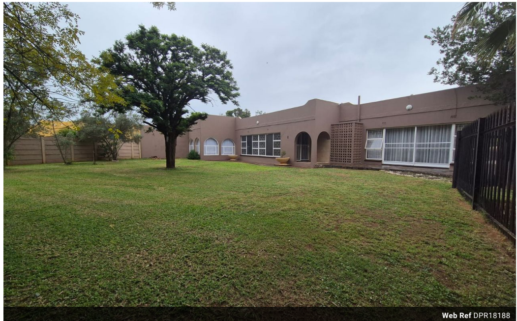
Web Ref DPR18188

18 Klipriver Drive Three Rivers Vereeniging