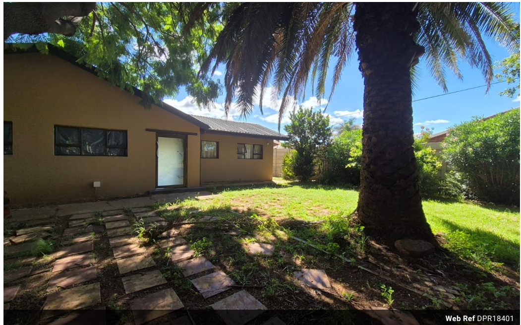
Web Ref DPR18401

18 Klipriver Drive Three Rivers Vereeniging