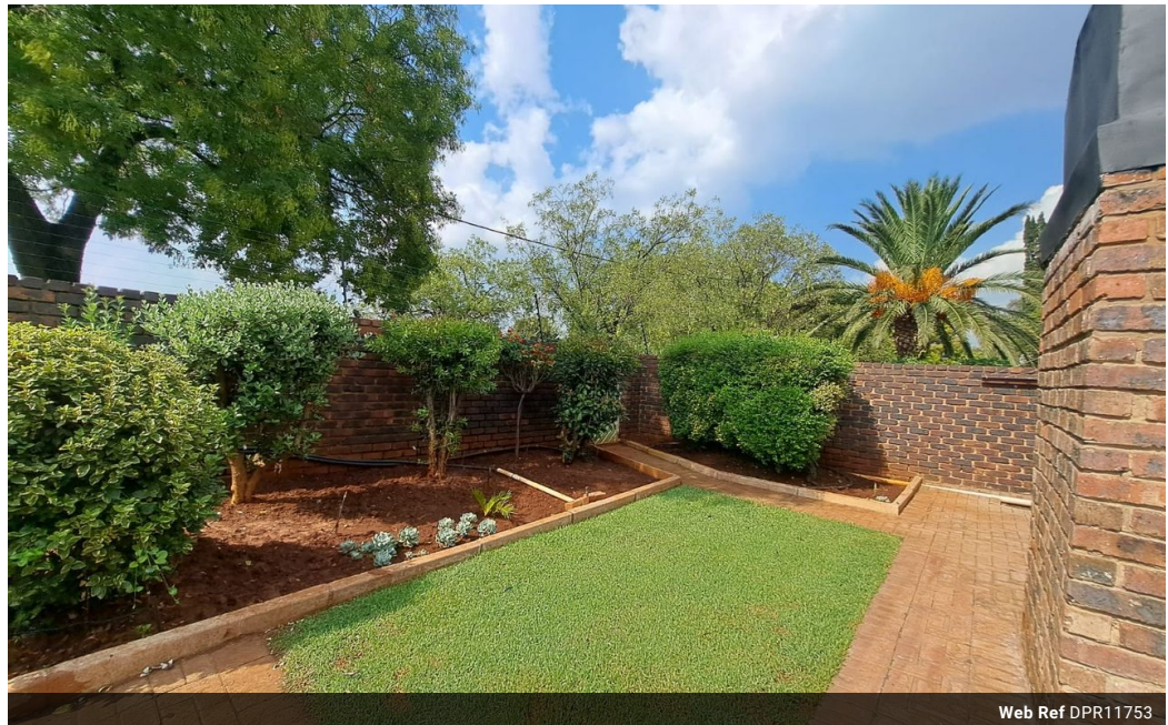
Web Ref DPR11753

18 Klipriver Drive Three Rivers Vereeniging