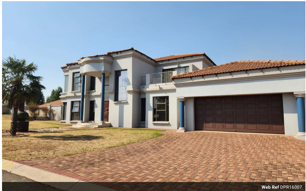
Web Ref DPR16007

18 Klipriver Drive Three Rivers Vereeniging