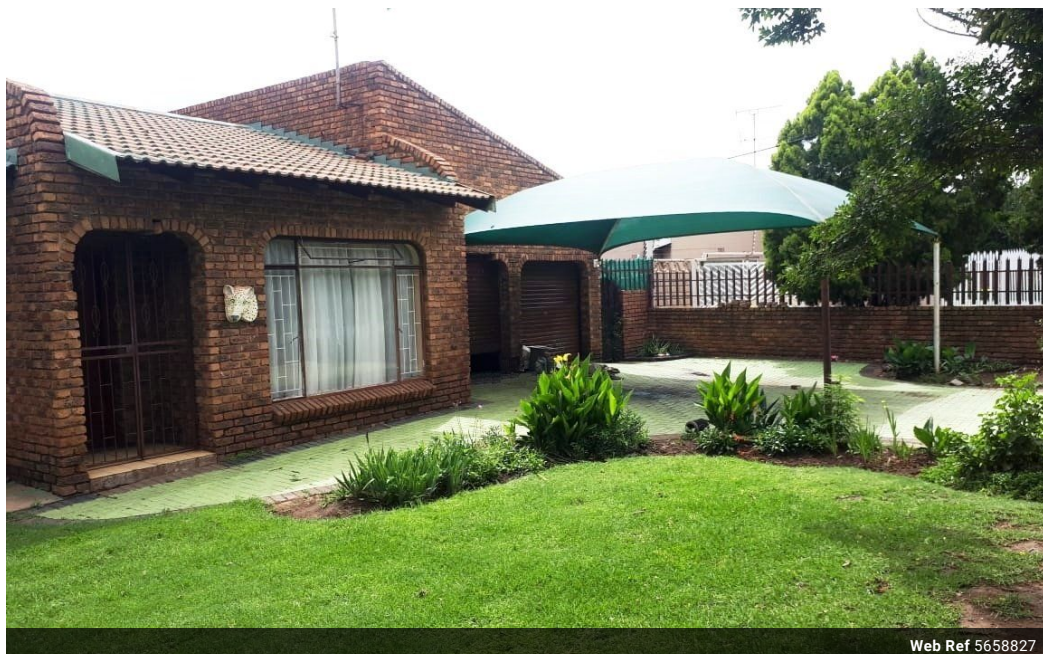
Web Ref 5658827

18 Klip River Drive, Three Rivers, Vereeniging