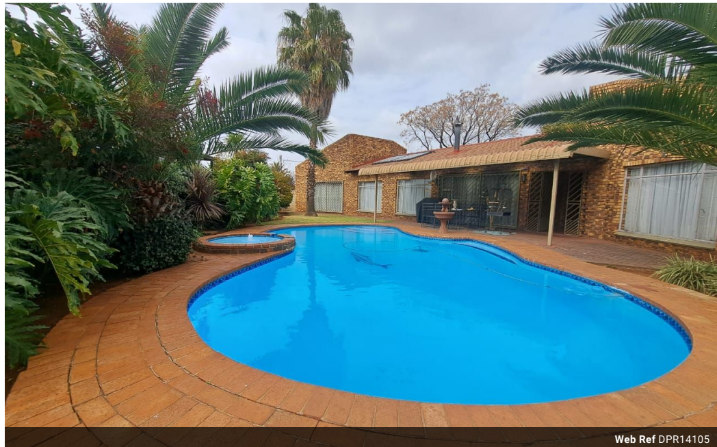
Web Ref DPR14105

18 Klipriver Drive Three Rivers Vereeniging