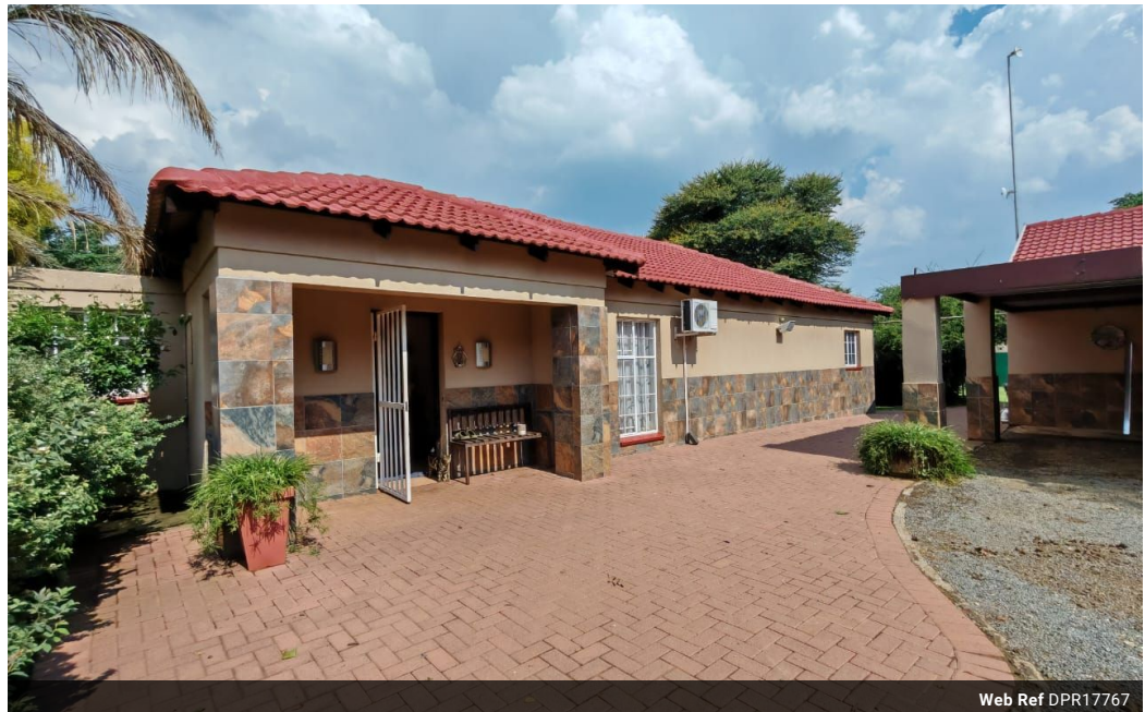
Web Ref DPR17767

18 Klipriver Drive Three Rivers Vereeniging