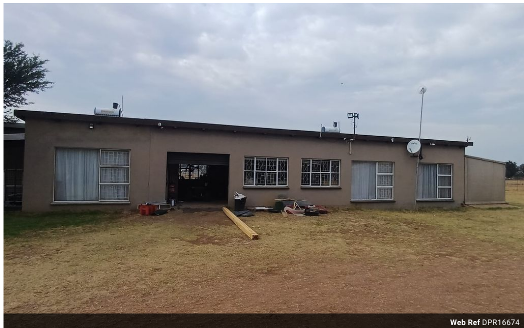
Web Ref DPR16674

24 Glynn Street Rothdene, Meyerton, 1961