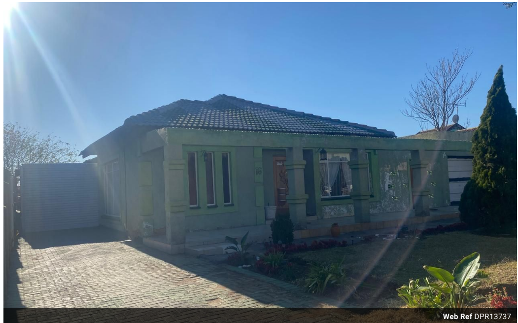
Web Ref DPR13737

18 Klipriver Drive Three Rivers Vereeniging