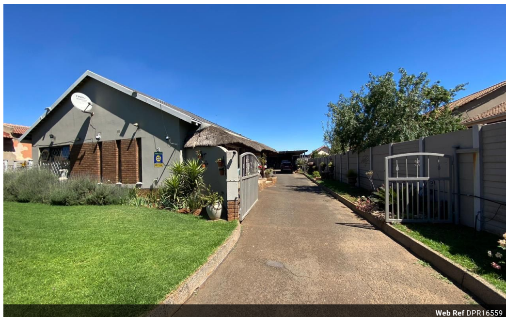
Web Ref DPR16559

18 Klipriver Drive Three Rivers Vereeniging