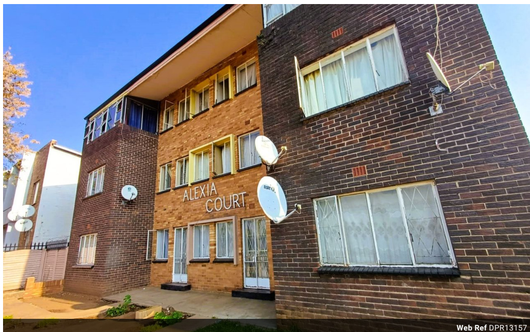
Web Ref DPR13157

18 Klipriver Drive Three Rivers Vereeniging