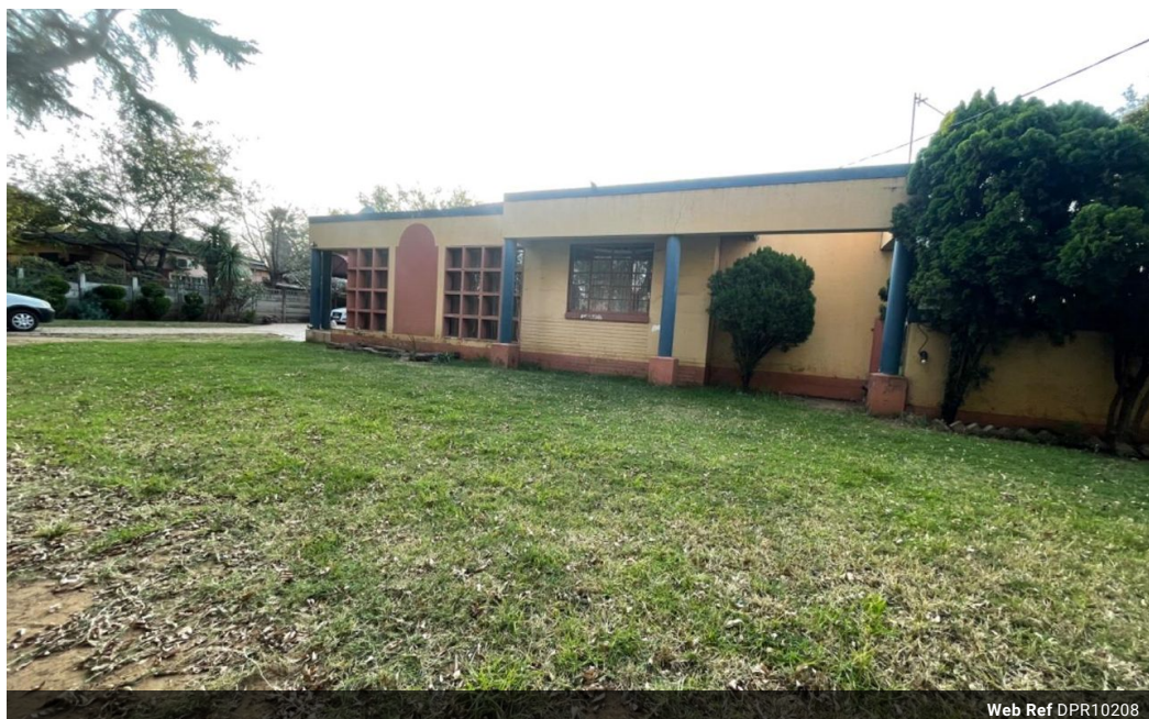
Web Ref DPR10208

Shop 2, The Palms Shopping Center, Louis Trichardt Blvd, Vanderbijlpark, 1911