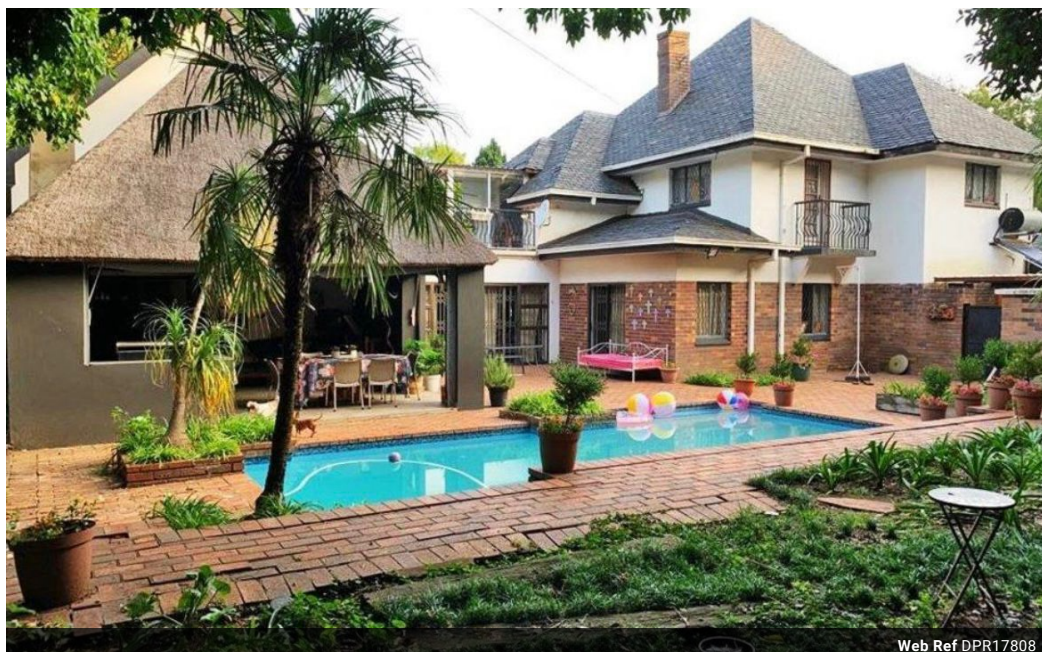
Web Ref DPR17808

18 Klipriver Drive Three Rivers Vereeniging