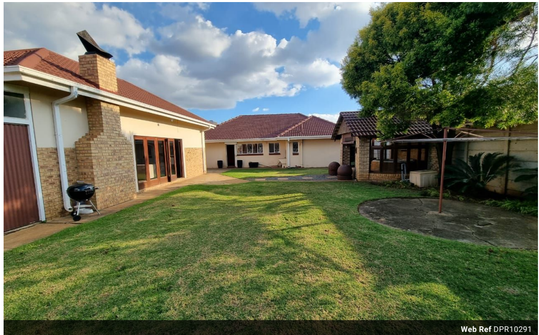
Web Ref DPR10291

18 Klipriver Drive Three Rivers Vereeniging