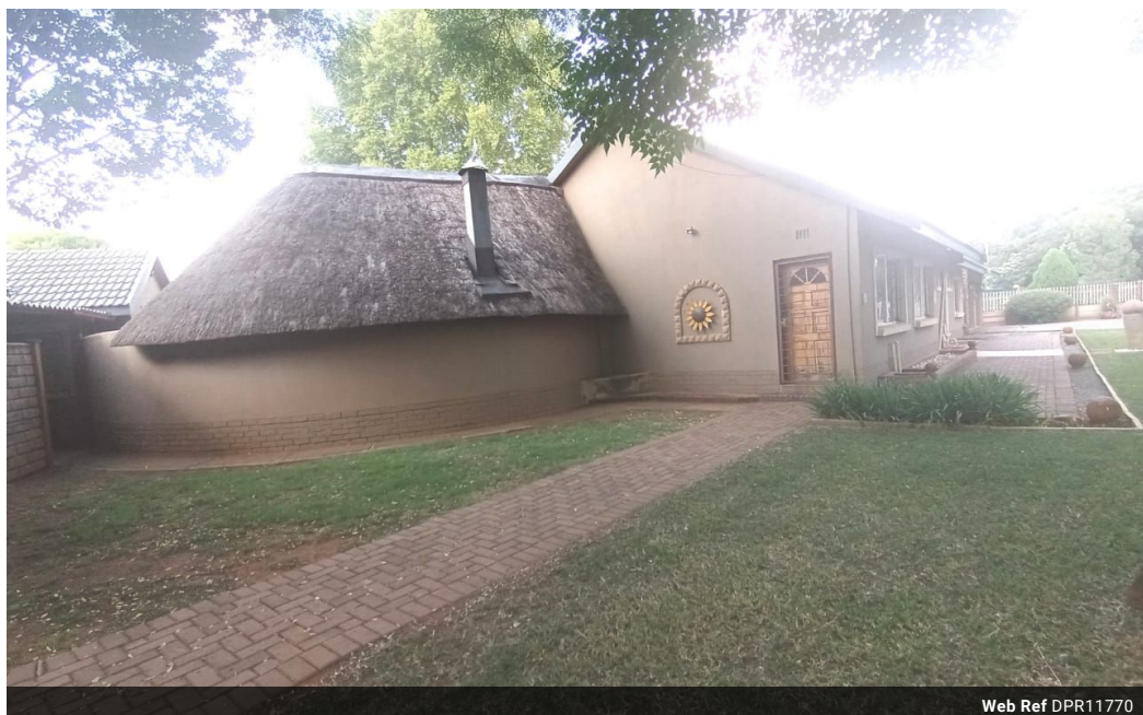
Web Ref DPR11770

18 Klipriver Drive Three Rivers Vereeniging