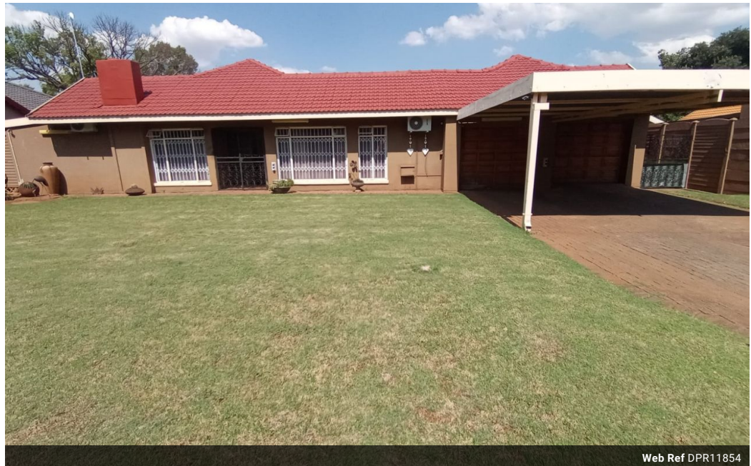
Web Ref DPR11854

18 Klipriver Drive Three Rivers Vereeniging