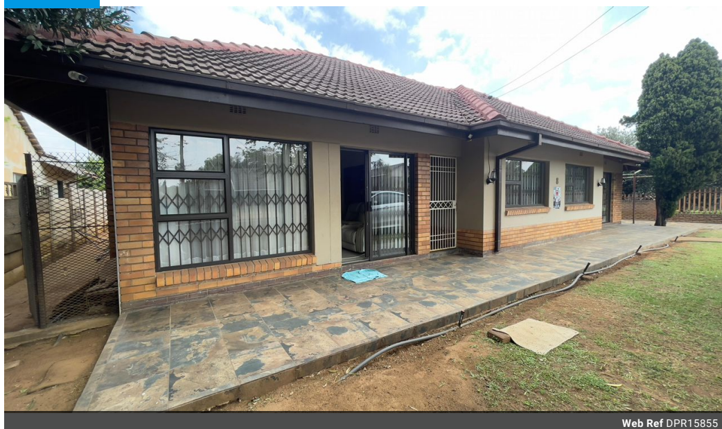
Web Ref DPR15855