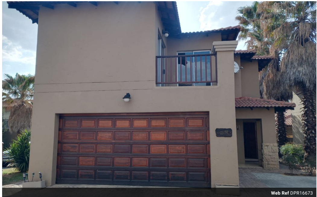
Web Ref DPR16673

18 Klipriver Drive Three Rivers Vereeniging