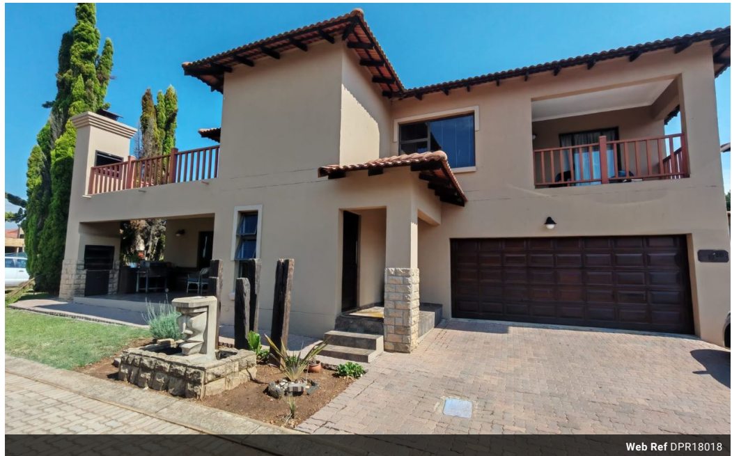
Web Ref DPR18018

18 Klipriver Drive Three Rivers Vereeniging