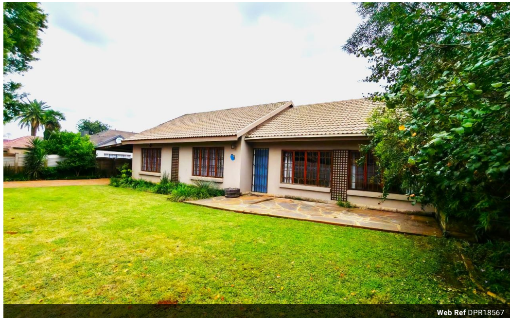
Web Ref DPR18567

18 Klipriver Drive Three Rivers Vereeniging