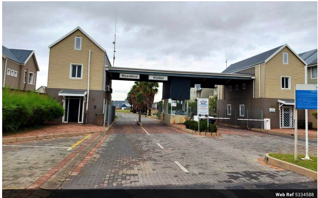
Web Ref 5334588

18 Klip River Drive, Three Rivers, Vereeniging