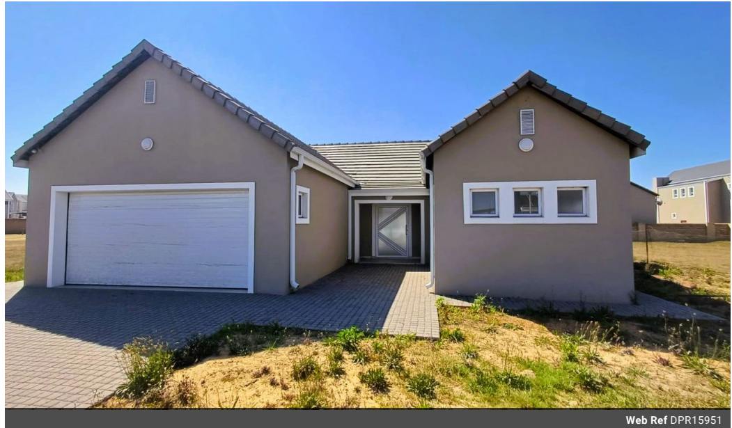
Web Ref DPR15951

Shop 2, The Palms Shopping Center, Louis Trichardt Blvd, Vanderbijlpark, 1911