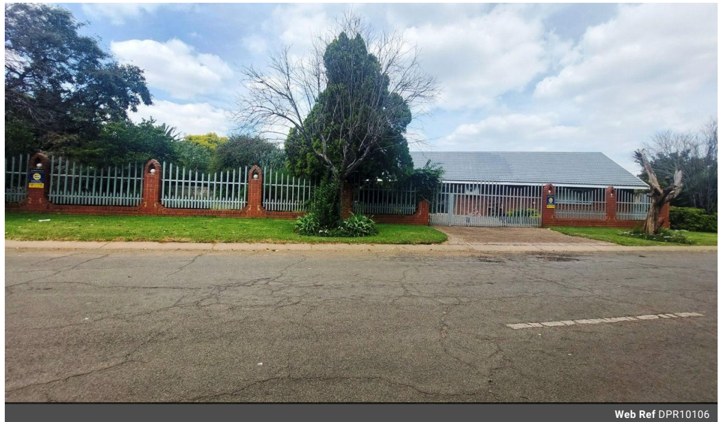
Web Ref DPR10106

18 Klipriver Drive Three Rivers Vereeniging