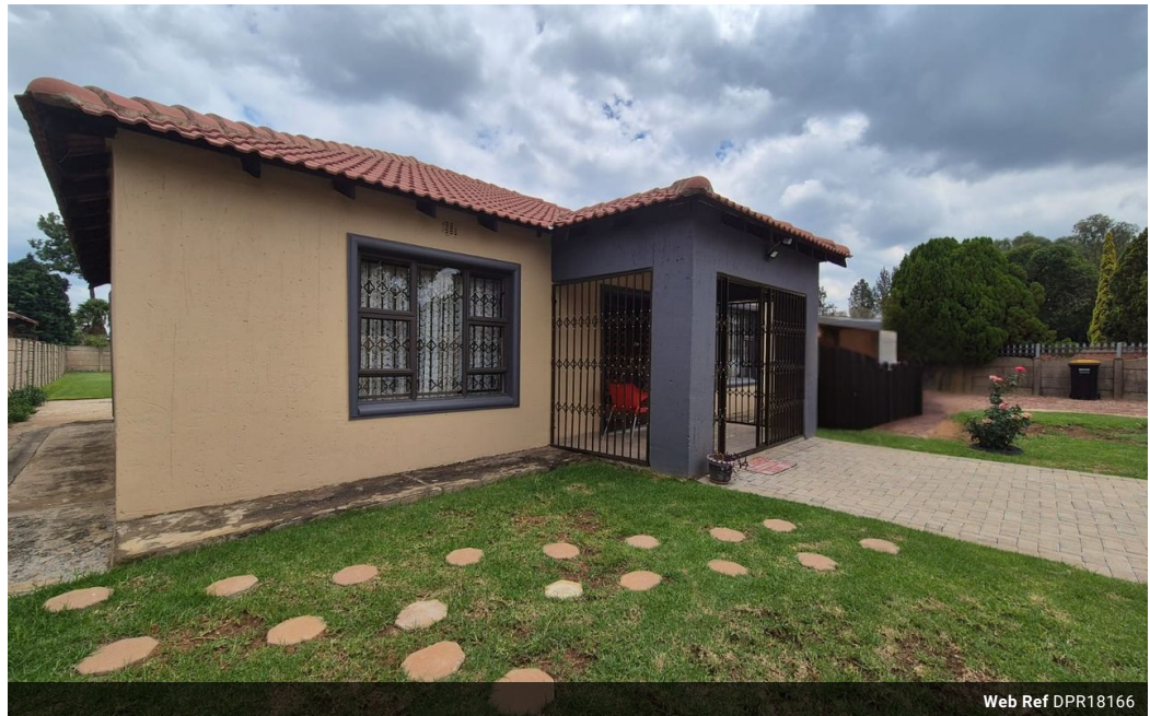
Web Ref DPR18166

18 Klipriver Drive Three Rivers Vereeniging