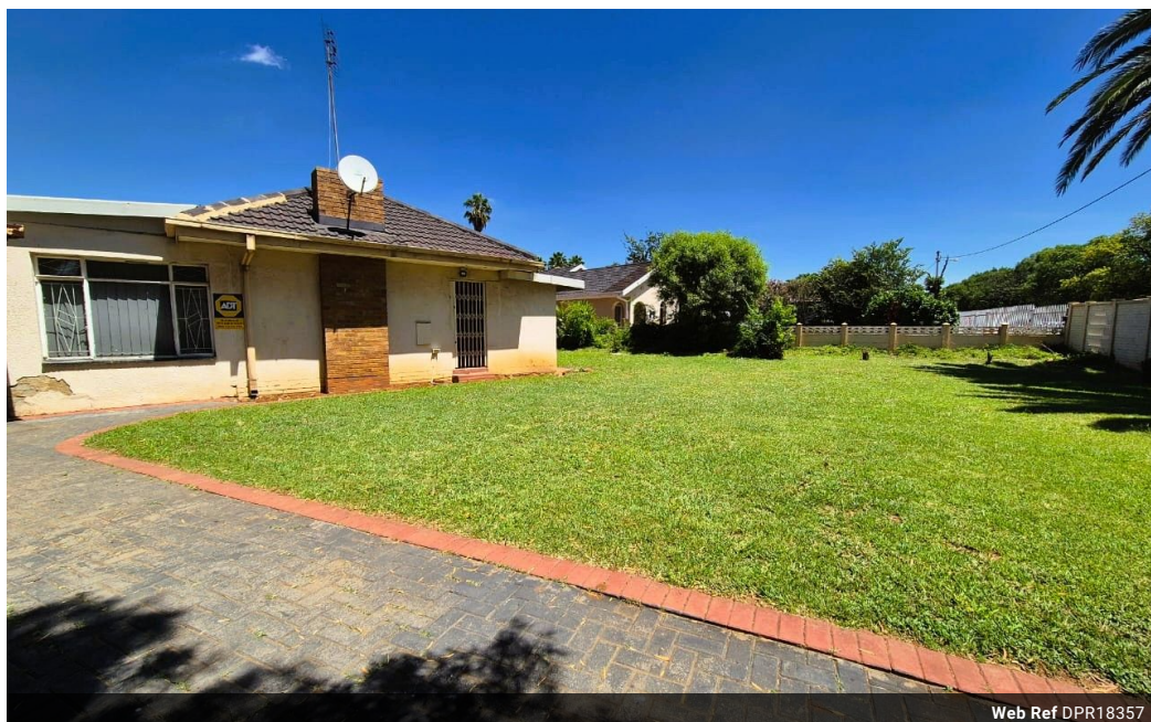
Web Ref DPR18357

18 Klipriver Drive Three Rivers Vereeniging