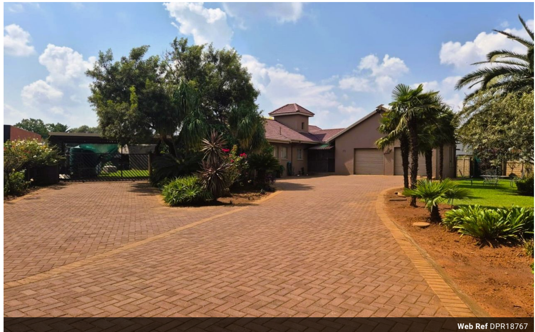
Web Ref DPR18767

18 Klipriver Drive Three Rivers Vereeniging