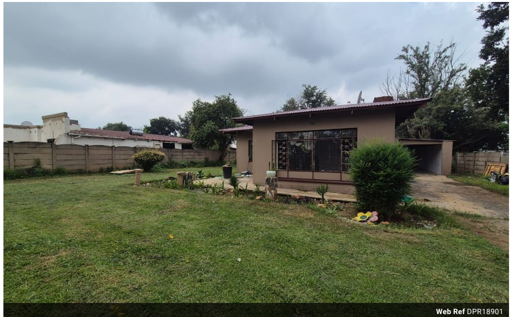
Web Ref DPR18901

18 Klipriver Drive Three Rivers Vereeniging