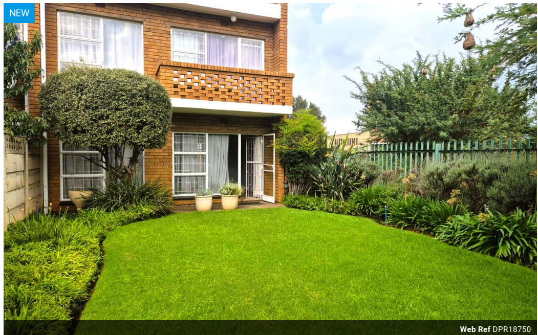
Web Ref DPR18750

18 Klipriver Drive Three Rivers Vereeniging