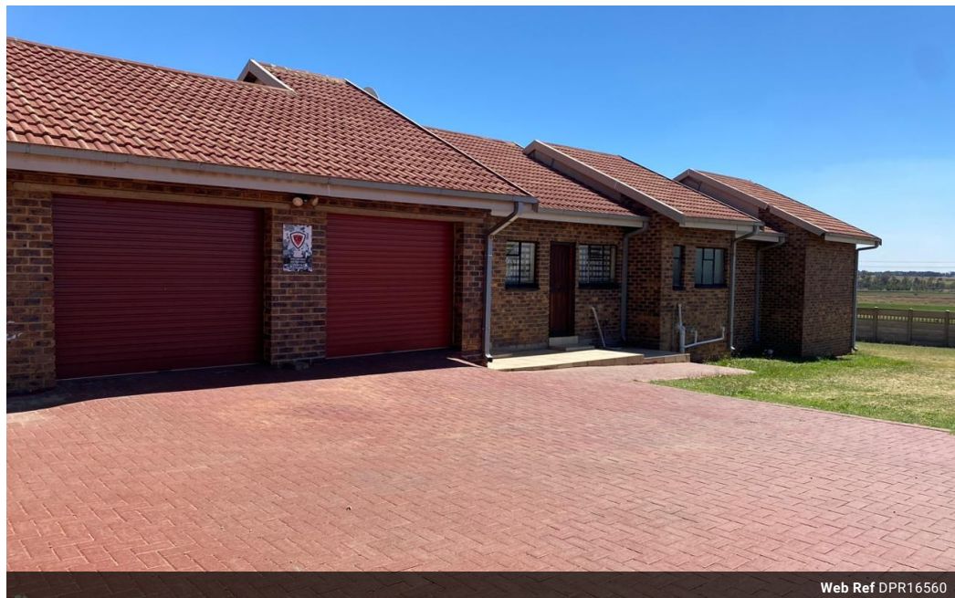
Web Ref DPR16560

18 Klipriver Drive Three Rivers Vereeniging