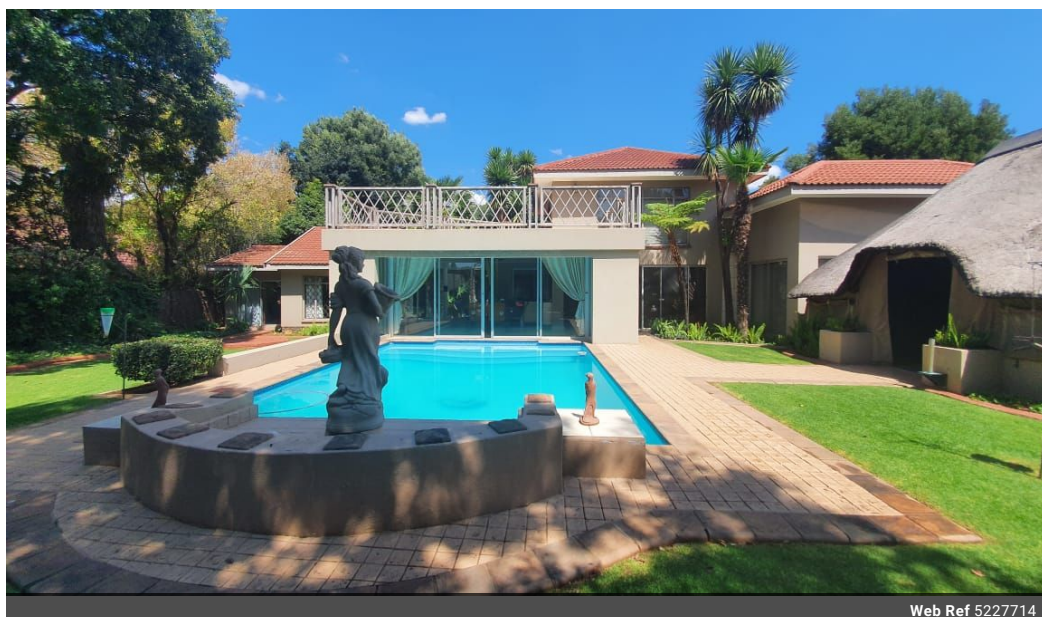
Web Ref 5227714

18 Klip River Drive, Three Rivers, Vereeniging