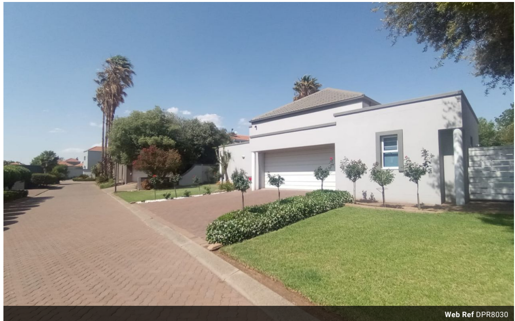
Web Ref DPR8030

18 Klipriver Drive Three Rivers Vereeniging