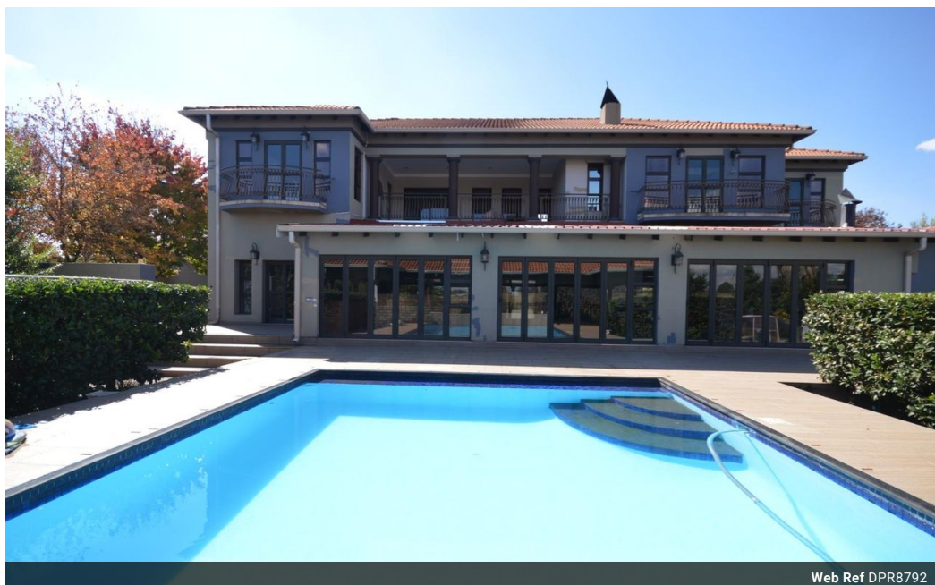
Web Ref DPR8792

18 Klipriver Drive Three Rivers Vereeniging