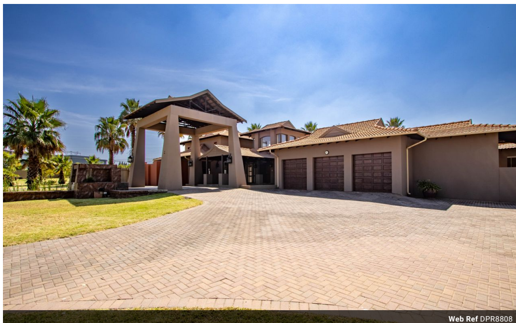
Web Ref DPR8808

18 Klipriver Drive Three Rivers Vereeniging