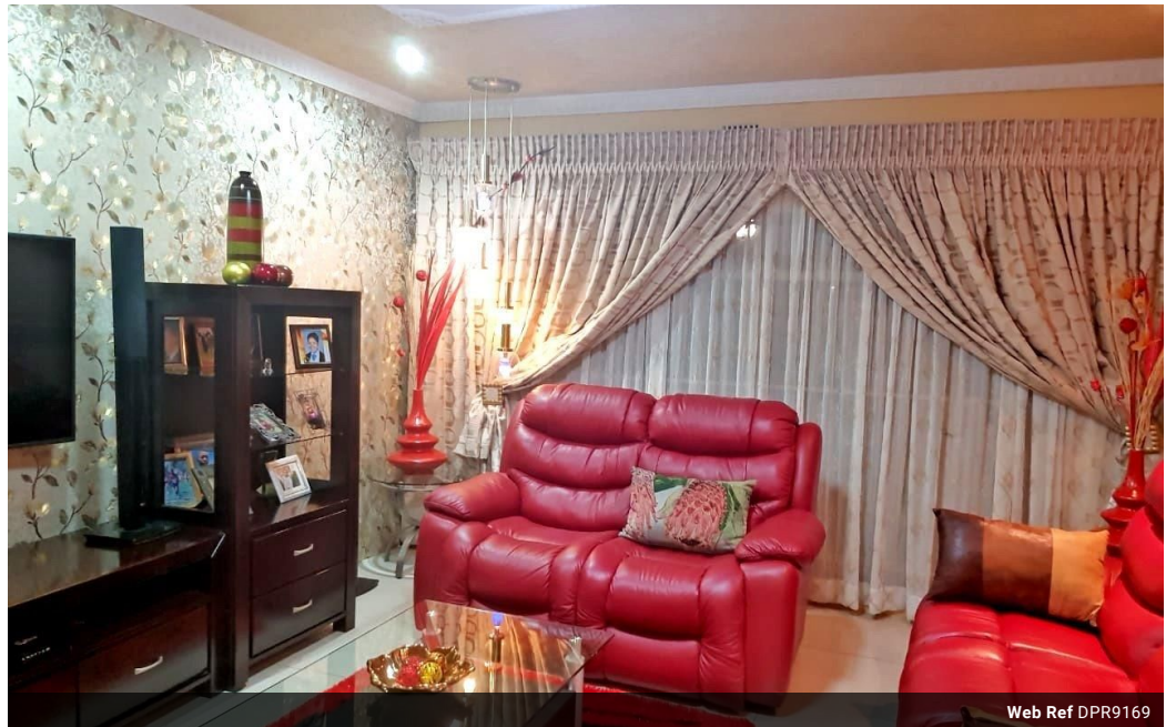
Web Ref DPR9169

18 Klipriver Drive Three Rivers Vereeniging